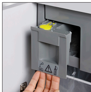
Built in EvenFlow Lubrication System evenly lubricates the cutting cylinders reducing the risk of a paper jam.