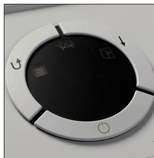
The easy-to-use command dial controls all of the shredder's functions such as power up, reverse, and continuous run.