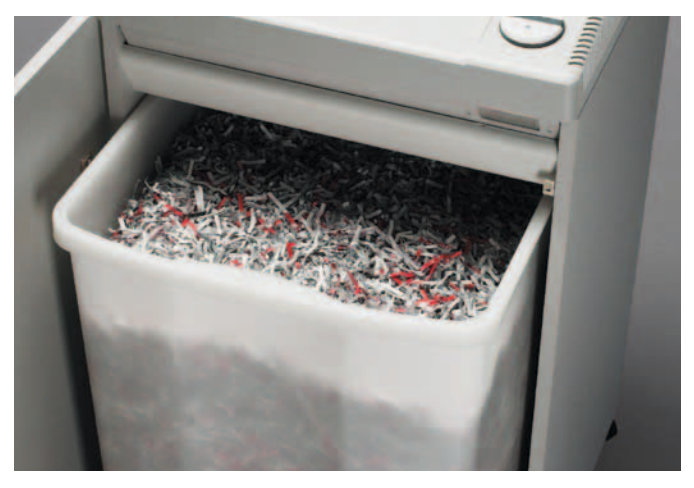
PRACTICAL SHRED BIN Convenient, environmentally-friendly shred bin (no disposable shred bags required).