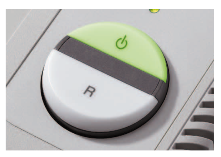
EASY_SWITCH Ease of operation: intelligent multifunction switch element with integrated optical signals indicating the operational status. Additional "emergency switch" function.

SOLID STEEL CUTTING SHAFTS Robust and durable: high-quality paper clip proof cutting shafts from special hardened steel. Lifetime guarantee on the cutting shafts under conditions of fair wear and tear.